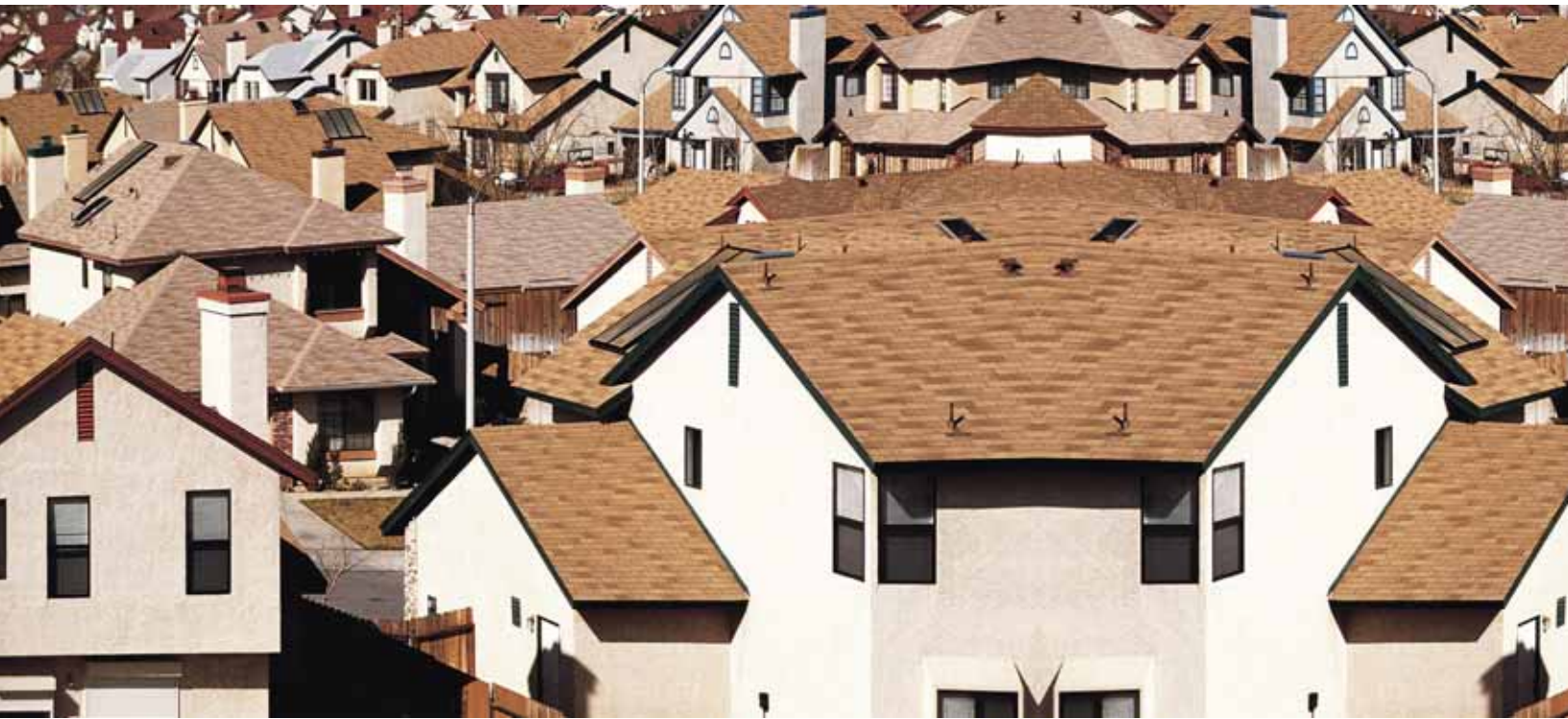
FANDRA CHANG, End of Horizons (Derived from "Eyewire Images: Main Street America E008417"), Fuji Crystal Archive on Plexiglas, 13 x 59 inches, 2000.

Cost-effectiveness is measured on a life-cycle basis, taking into account the initial purchase price, operational costs, improvements, and long-term maintenance and repairs. In high-performance construction or renovation, the initial design is done with future enhancement in mind. Building science dictates the most appropriate design, materials, technologies, and site orientation. Precise, cost-effective execution follows through engineering, construction, and operations. Once high performance is achieved, a home becomes as cost-effective to own as it is to purchase, energy costs are minimized if not eliminated, building performance is maximized, and the quality of life for building occupants is enhanced.